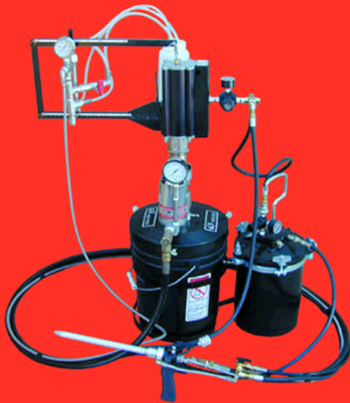
MODEL LWRM-LITE-5 SHOWN